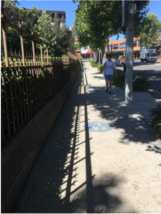
Lee Street, Chippendale (c)