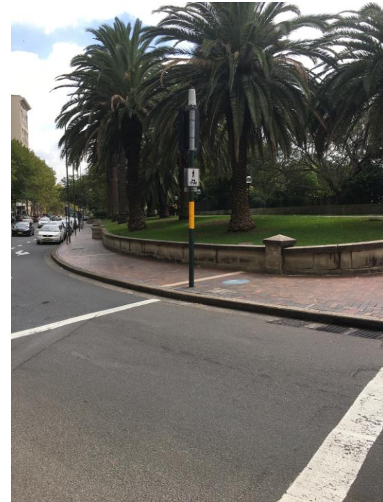
Macquarie St, Sydney