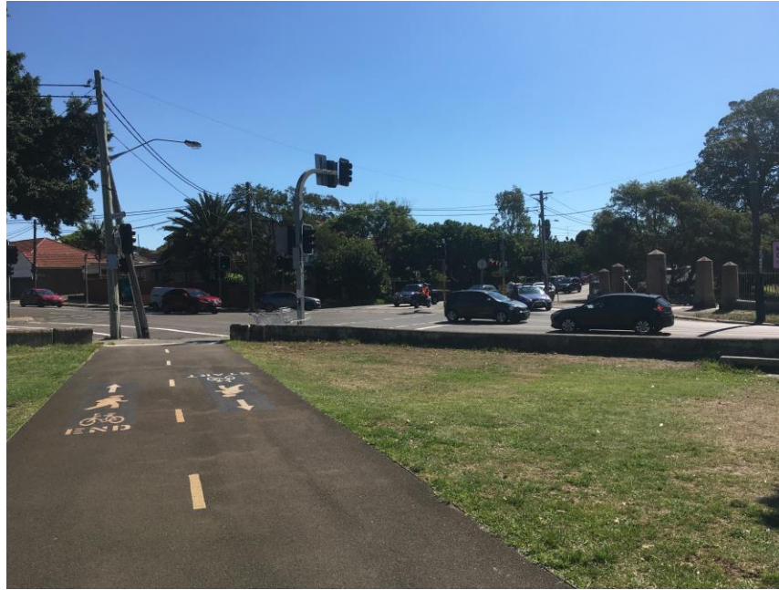
Queens Park (Darley Road and Avoca Street)