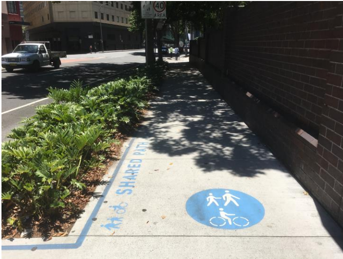
Lee Street, Chippendale (b)