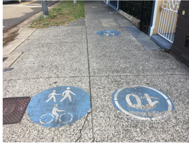
Redfern (South Dowling / freeway crossing iontersection)